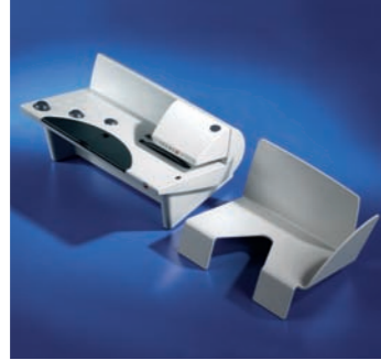
Frama Access B300