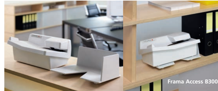
Frama Access B300